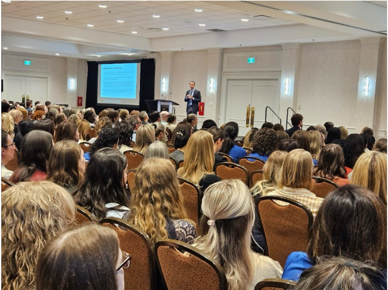
More Pictures from CAA Conference 2024