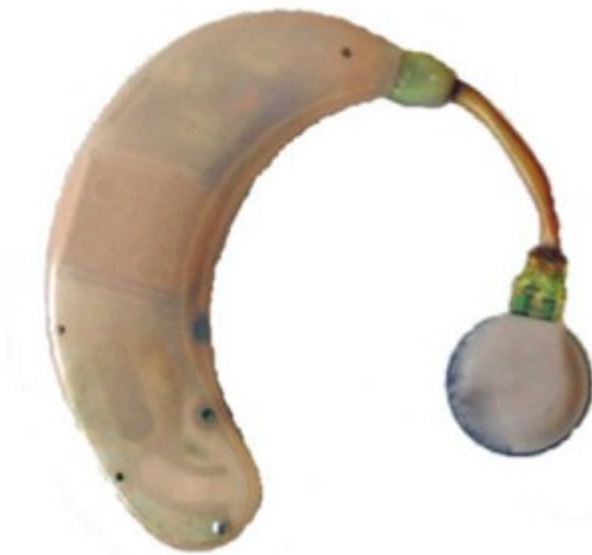
Fig. 25. The humongous Zenith “Diplomat” BTE hearing aid—Zenith’s first BTE hearing aid (Jun, 1956).