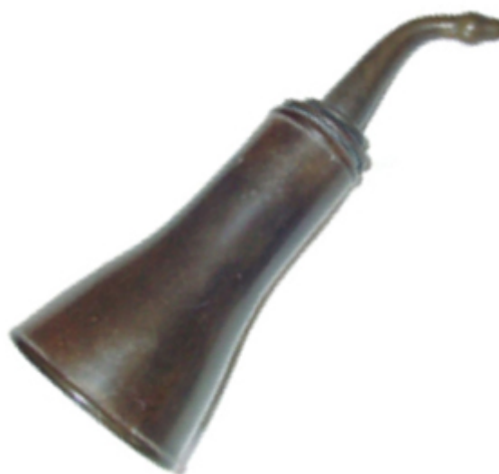
Fig. 4. This three-section hard- rubber ear trumpet is shown collapsed to 17.8 cm (7”) (c.