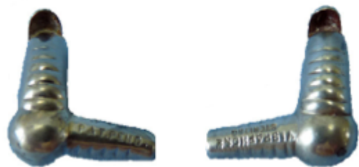
Fig. 10. Vibraphones (1925) were quack devices—they simply didn't work. This pair of sterling silver Vibraphone's measured 1.9 cm (3 \frac{3}{4} ") along each side of the “L”.