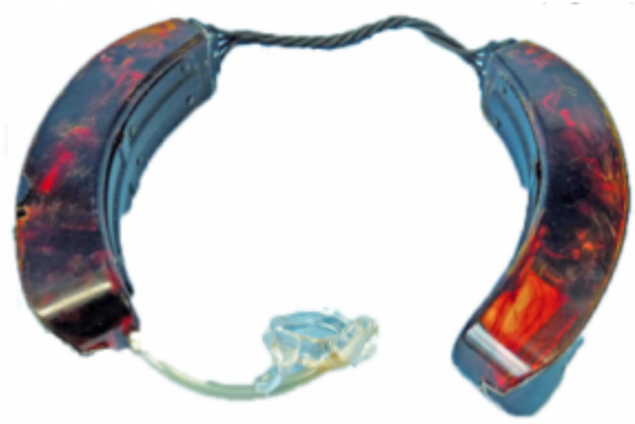
Fig. 20. Acousticon's Model A-200—a rare double-barrette vacuum-tube hearing aid for the ladies (1951).

For the ladies, Acousticon designers created a vacuum-tube hearing aid that masqueraded as a beautiful faux tortoiseshell double-barrette (Fig. 20).