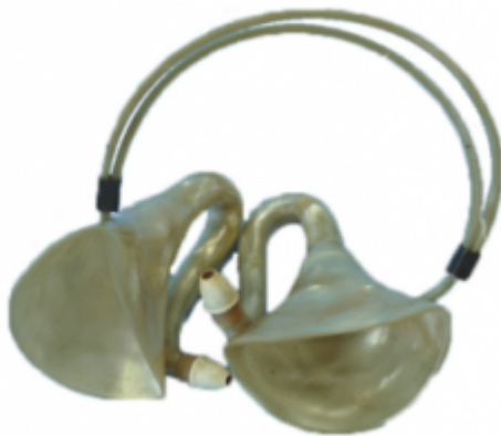
Fig. 9. Ladies rare, but beautiful, imitation mother-of-pearl auricles (1915). Each auricle was about 10 cm (4") long.