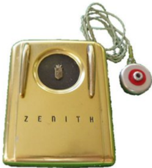
Fig. 23. The Zenith “Royal” vacuum-tube hearing aid was one of Zenith’s last vacuum tube hearing aids made (Feb, 1952).