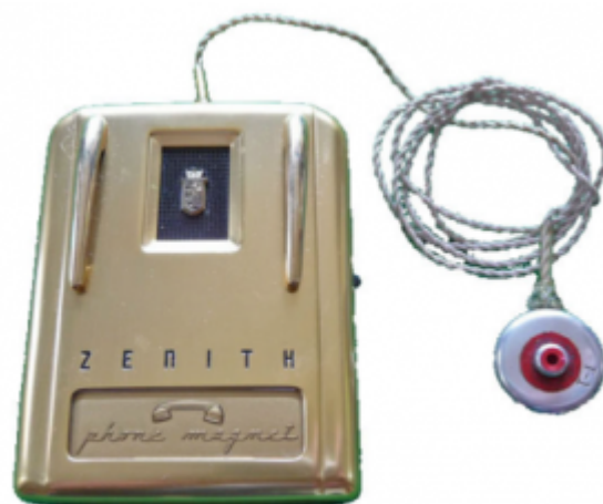
Fig. 24. The Zenith “Royal T” was Zenith’s first all-transistor hearing aid (Feb, 1953). It was the same size as the “Royal” vacuum-tube aid. Note that it had a t-coil built in—called a “phone magnet” in those days.

The first transistor hearing aids looked almost identical to the vacuum tube models that preceded them. For example, the Zenith “Royal” (Fig. 23) vacuum tube hearing aid of 1952 and the Zenith “Royal T” (Fig. 24) transistor hearing aid of 1953 were the same size. The difference was inside. However, it didn’t take long before the size of transistor hearing aids had shrunk considerably.