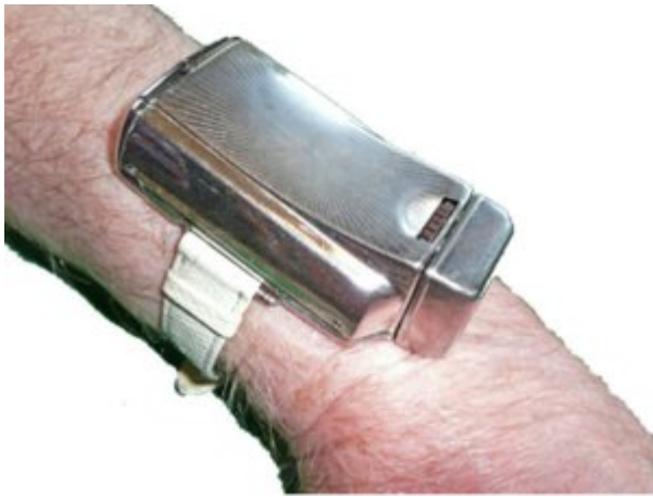
Fig. 19. Acousticon's Model A-165 was the only wrist-worn vacuum-tube hearing aid ever made (1950).