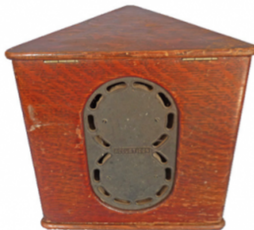
Fig 12. The Acousticon Dining Table Model carbon hearing aid had 6 microphones—2 on each side (1908- 1910).

As a result, there were carbon hearing aids with 1, 2 or 4 microphones, and less commonly more. A dining room table model in the Museum consists of 3 double carbon microphones (Fig. 12). Carbon hearing aids typically ran on 3 volt or 41 2/3 volt batteries.