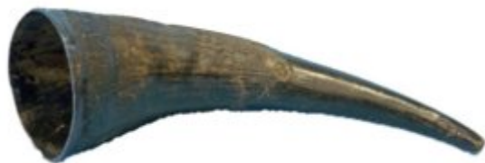
Fig. 1. Early animal horn ear trumpets may have looked like this Bison ear trumpet.

The earliest ear trumpets were made from natural materials such as hollowed out cow and rams horns (Fig. 1) and some snail-shaped seashells.