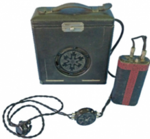
Fig. 13. The Acousticon Model 28 carbon hearing aid—a lower- powered single carbon microphone hearing aid shown in its resonant case (1927).

Higher-powered carbon hearing aids had two microphones (Fig. 14) typically housed in a one-piece case. The microphone could be in a “lunch-box” or worn around the neck. High powered 4-microphone carbon hearing aids (Fig. 15) typically were housed inside “lunch-box” sized tabletop cases.