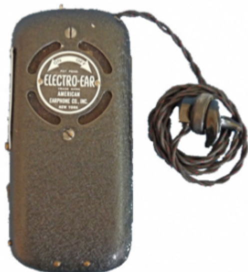
Fig. 16. The “tiny” Electro-Ear Model 5 wearable carbon hearing aid had internal batteries (c.1938).

s) so you could wear many of them (Fig. 16).