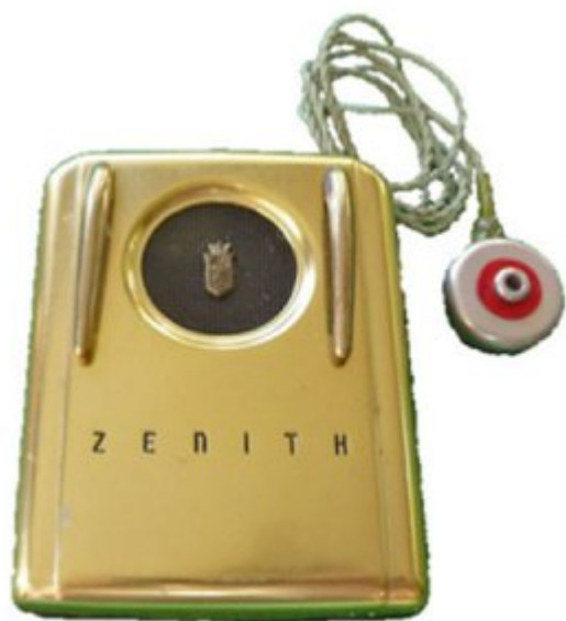
Fig. 23. The Zenith “Royal” vacuum-tube hearing aid was one of Zenith’s last vacuum tube hearing aids made (Feb, 1952).