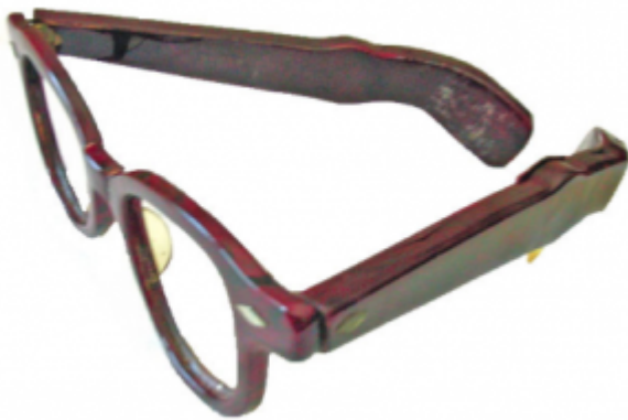
Fig. 27. The Otariion Model L10 “Listener”—the world’s first transistorized, eyeglass hearing aid (Dec, 1954).

Eyeglass hearing aids actually predated BTE aids by a year or so. The world’s first fully-contained, transistorized, eyeglass hearing aid was Otariion’s L10 “Listener” (Fig. 27). It came out in Dec, 1954.