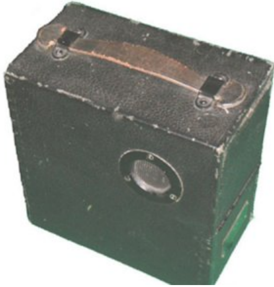
Fig. 17. The Globe “Vactuphone”—the first commercially- produced vacuum tube hearing aid (1921). This Vactuphone hearing aid still works after all these years. The tube is now 92 years old!

With the invention of a practical triode vacuum tube, numerous hearing aid manufacturers began building vacuum-tube hearing aids. Vacuum-tube hearing aids required two batteries, a 11?2 volt “A” battery to heat the filament, and a 45 volt “B” battery to provide the plate current. Over time, with smaller and more efficient vacuum tubes, they got the “B” battery down to 15 volts and consequently, much smaller in size.