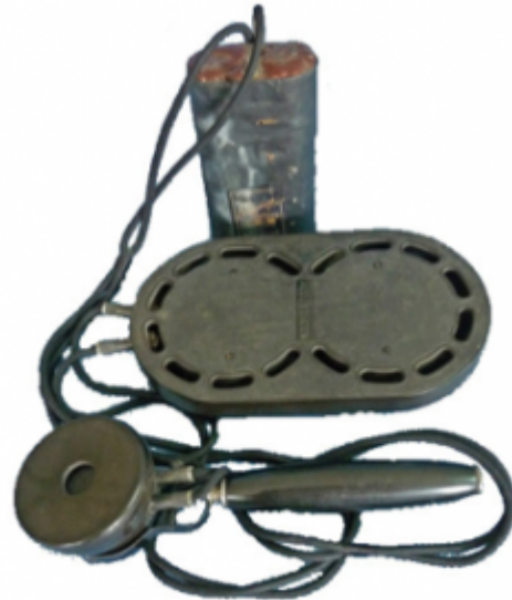
Fig. 14. The Acousticon Model SRD was a medium-powered double carbon microphone hearing aid. You could wear the double-carbon microphone around your neck or clipped to your shirt-front (1910 – 1928).

Higher-powered carbon hearing aids had two microphones (Fig. 14) typically housed in a one-piece case. The microphone could be in a “lunch-box” or worn around the neck. High powered 4-microphone carbon hearing aids (Fig. 15) typically were housed inside “lunch-box” sized tabletop cases.