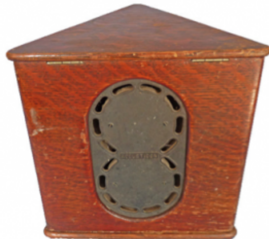
Fig 12. The Acousticon Dining Table Model carbon hearing aid had 6 microphones—2 on each side (1908- 1910).

As a result, there were carbon hearing aids with 1, 2 or 4 microphones, and less commonly more. A dining room table model in the Museum consists of 3 double carbon microphones (Fig. 12). Carbon hearing aids typically ran on 3 volt or 41/2 volt batteries.