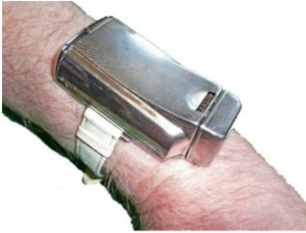
Fig. 19. Acousticon's Model A-165 was the only wrist-worn vacuum-tube hearing aid ever made (1950).