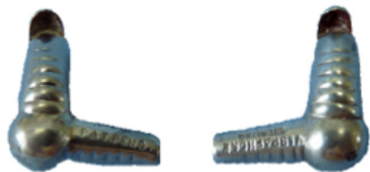
Fig. 10. Vibraphones (1925) were quack devices—they simply didn't work. This pair of sterling silver Vibraphone's measured 1.9 cm (3/4") along each side of the “L”.