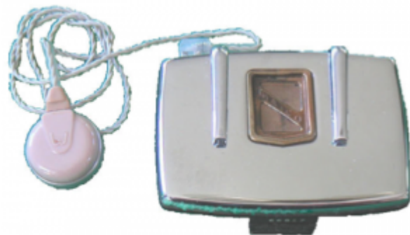
Fig. 22. Maico's Model O "Transist-Ear" was the world's first all-transistor body hearing aid

Vacuum tube hearing aids had their heyday from the mid 1940s to 1952. Then, almost overnight, vacuum tube hearing aids went the way of the Dodo bird when, in December of 1952, Sonotone came out with their Model 1010 (Fig. 21). This was the world's first hearing aid with a transistor in it. (Actually, this hearing aid was a hybrid—containing 1 transistor and 2 vacuum tubes.)