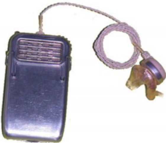
Fig. 21. Sonotone's Model 1010 hybrid (1 transistor & 2 vacuum tubes)—the first hearing aid in the world to use a transistor (Dec, 1952).

Vacuum tube hearing aids had their heyday from the mid 1940s to 1952. Then, almost overnight, vacuum tube hearing aids went the way of the Dodo bird when, in December of 1952, Sonotone came out with their Model 1010 (Fig. 21). This was the world's first hearing aid with a transistor in it. (Actually, this hearing aid was a hybrid—containing 1 transistor and 2 vacuum tubes.)