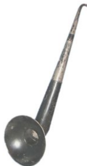
Fig. 2. This F. C. Rein collapsible metal ear trumpet was 66 cm (26”) long and had a 17.8 cm (7”) bell (c. 1850).

As time went by, ear trumpets continued to shrink so that by 1890 or so many ear trumpets were around 25 cm (12”) long and collapsed into shorter sections for ease in carrying them (Fig. 4). When collapsed, their overall length was 15 - 18 cm (6” - 7”) or less— small enough to carry in a pocket or purse.