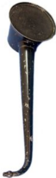
Fig. 5. The high-powered “Dipper” was 41.9 cm (16½”) long while the bowl was 12.7 cm (5”) in diameter. In 1876, it sold for $4.50.

Higher-powered ear trumpets had large resonant bowls to capture more sound. One of these was colloquially called “the Dipper” (Fig. 5) since it resembled the shape of an early dipper for dipping water out of a water barrel. It’s large size and large bowl made it the high-powered hearing aid of the 1880s. As a matter of interest, the large bowl collected and emphasized lower-frequency sounds. Thus, it sounded rather bassy.