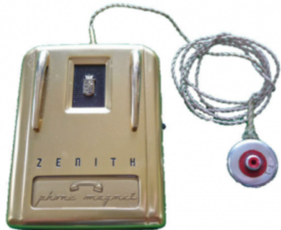
Fig. 24. The Zenith “Royal T” was Zenith’s first all-transistor hearing aid (Feb, 1953). It was the same size as the “Royal” vacuum-tube aid. Note that it had a t-coil built in—called a “phone magnet” in those days.

The first transistor hearing aids looked almost identical to the vacuum tube models that preceded them. For example, the Zenith “Royal” (Fig. 23) vacuum tube hearing aid of 1952 and the Zenith “Royal T” (Fig. 24) transistor hearing aid of 1953 were the same size. The difference was inside. However, it didn’t take long before the size of transistor hearing aids had shrunk considerably.