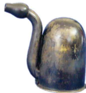
Fig. 6. This tiny “London Dome” ear trumpet was 6.7 cm (2½”) high and had a bell diameter of 4.4 cm (1¾”). A person could easily hide it in their cupped hand (c. 1900).

Many of these were in the shape of parabolic domes (Fig. 6) patterned after the dome of St. Paul’s Cathedral in London. Hence they were called “London Domes”.