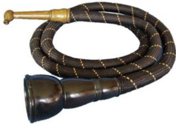
Fig. 8. A longer conversation tube at 142 cm (55 \frac{3}{4} ") with wooden earpiece & hard-rubber bell (c. 1860 – 1880).

A surprising thing is that when used properly, these conversation tubes worked wonderfully well—some seniors today find they work even better than their fancy, modern hearing aids. Unfortunately, conversation tubes aren't as convenient to use as are modern hearing aids. Since conversation tubes worked so well, they were still being manufactured and used as late as 1976 in the UK.