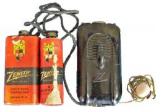
Fig. 18. The Zenith Model A3A-B3A “Radionic”—a two-piece vacuum-tube hearing aid. The large “B” battery is on the left and the round “A” battery beside it (1944).