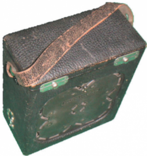
Fig. 15. The high-powered (4 microphone) Acousticon Model RF carbon hearing aid had a six-step volume control on the left end of the case to reduce the volume if it was too loud (1910 – 1923).