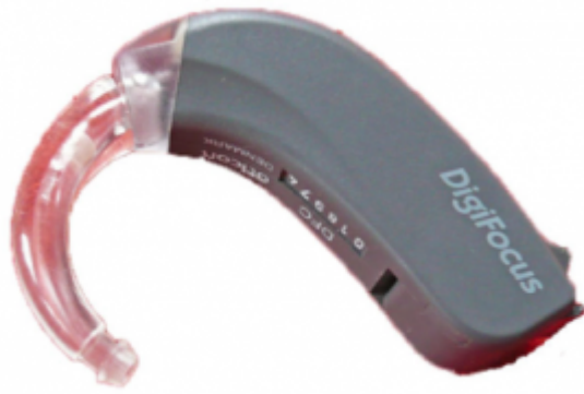
Fig. 28. The Oticon Model DFC “DigiFocus Compact” BTE—one of the first completely-digital BTE hearing aids made (1996).

For a number of years, hearing aids, were made with discrete components, then, with the invention of integrated circuits, the power and functionality of hearing aids increased dramatically. The digital revolution of the 1980s spawned digitally-programmable analog hearing aids. Then, in 1996, Widex came out with their “Senso”, and Oticon came out with their “DigiFocus Compact” (Fig. 28) BTE aids. These were the first commercially-successful, fully-digital hearing aids produced.