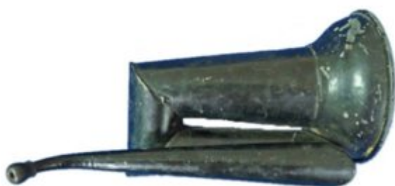
Fig. 3. This “Bonnafont” (bugle-shaped) ear trumpet (c. 1890) was just under 23 cm (9”) long.