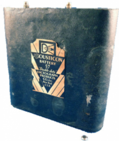
Fig. 29. The Acousticon No. 57 hearing aid battery—one of the largest hearing aid batteries made contrasted with the tiny Panasonic No. 5 battery—the smallest hearing aid battery made.

Nothing illustrates just how far hearing aids have come in the past 100 years than in the size of the batteries that powered them. Compare the