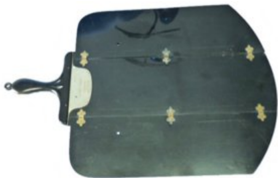
Fig. 11. Dentaphones were bone conduction hearing aids. The user flexed them against their upper teeth (1880). When unfolded and in use, Dentaphones were not small—35.5 x 23.7 cm (14" x 9 3/8"), making it impossible for people not to notice them!